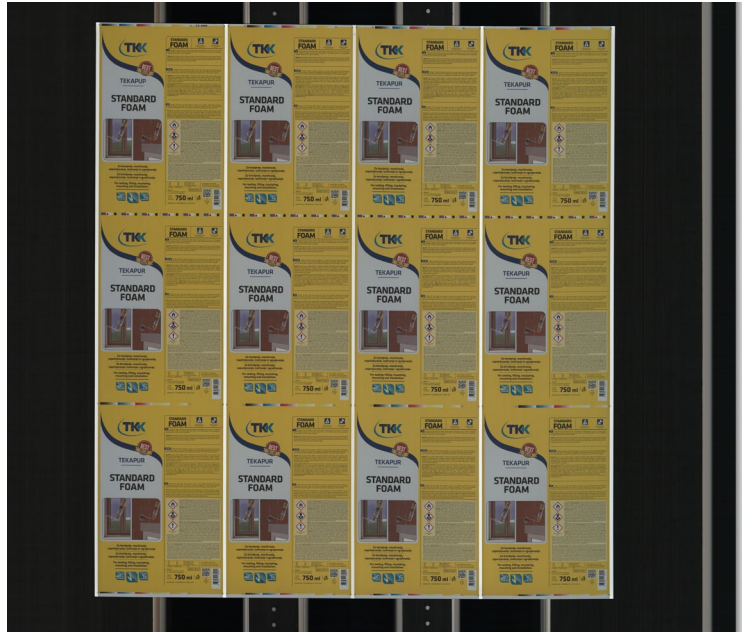
Metal sheet with color bar